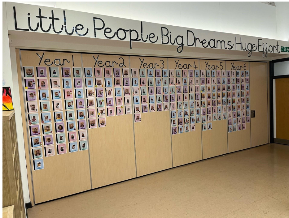
1 - Every child matters. Every moment counts.

Welcome back to a brand new school week.